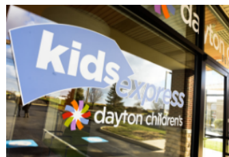
Dayton Children's Kids Express