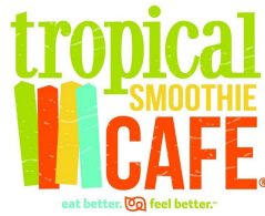
Tropical Smoothie Cafe