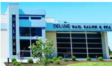
Deluxe Nail Salon and Spa